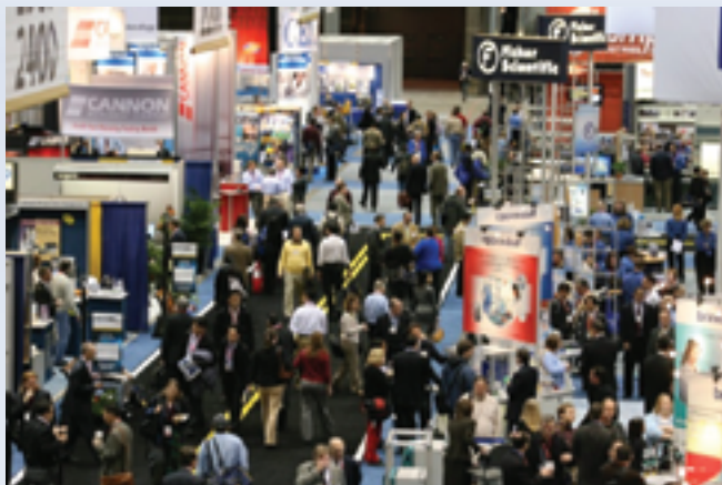
Figure 6 More than 1000 exhibitors are expected for Pittcon 2008.

scientific concept, or creative business model to potential end users, investors, and partners.