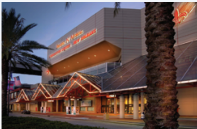
Figure 1 Ernest N. Morial Convention Center, New Orleans.

The New Orleans cultural and hospitality experience continues to thrive as well. At the annual Spring Pittcon Exhibitors Meeting, which was held in May in New Orleans, representatives from Pittcon-exhibiting companies were taken on a bus tour of the city and treated to dinner in small groups at many of the finest restaurants in the French Quarter.