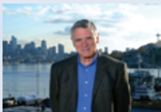
Figure 3 Dr. Leroy Hood, Plenary Lecturer.