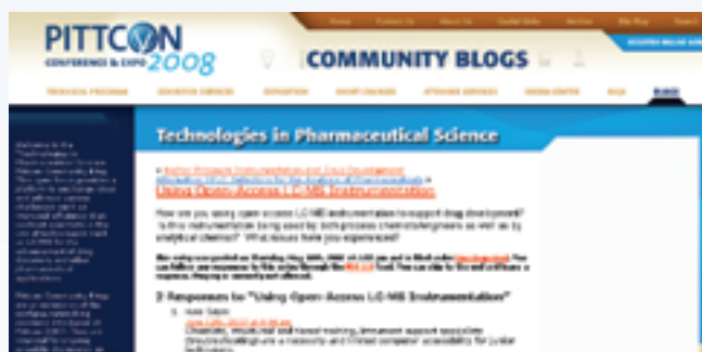
Figure 5 Pittcon has extended the Conferee Networking Sessions with scientific blogs on www.pittcon.org .

In continuing its efforts to expand the educational opportunities at the annual conference and exhibition, Pittcon 2008 will host a novel poster session and panel discussion called Lab 2015. The goal of this program is to explore promising new technology solutions that are one to three years away from widespread commercial adoption. It will also give emerging and early-stage companies and entrepreneurs the opportunity to present their novel technology, innovative