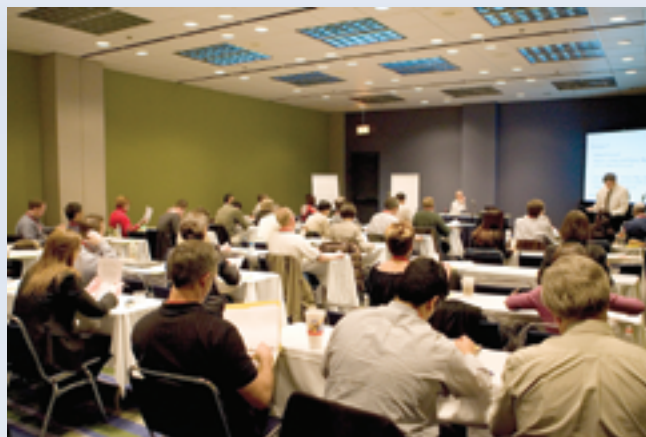
Figure 4 More than 100 Short Courses will be offered at Pittcon 2008.

To further facilitate scientific discussion, Pittcon 2007 introduced networking sessions to enable conferees to brainstorm and exchange ideas on specific topics of interest. The inaugural sessions, which were held in an informal environment and moderated by an expert in the field, were very well